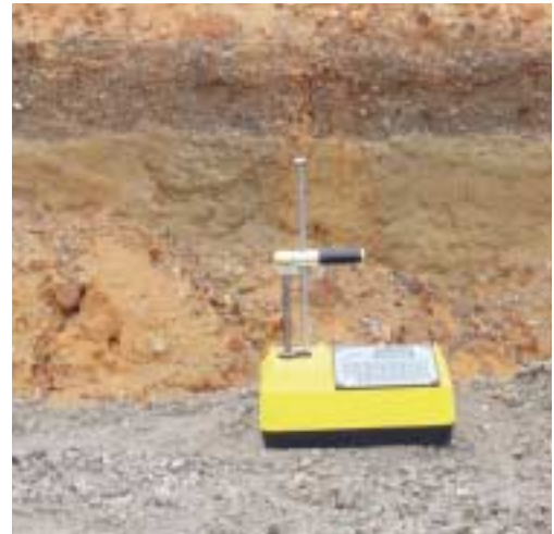
RoadReader™ Plus is versatile, quick and economical.