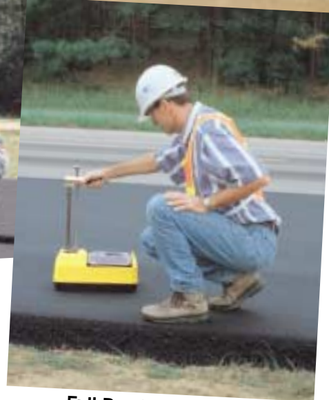
Full Depth Asphalt or Concrete