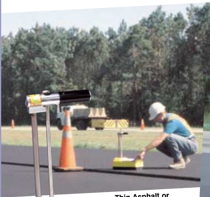
Thin Asphalt or Concrete Overlays