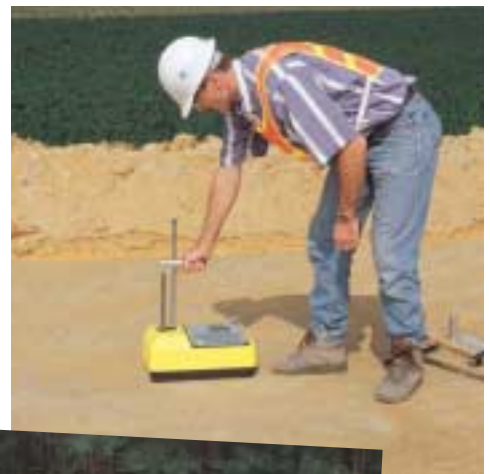
Soil and Aggregates