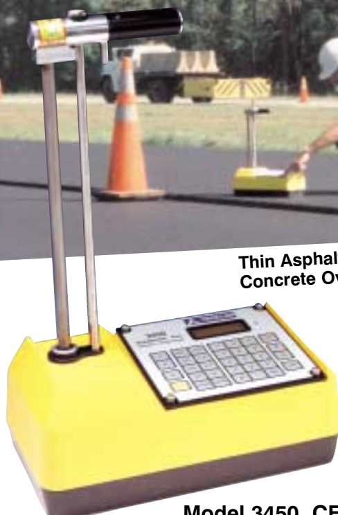
Model 3450 CE